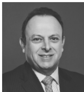
Executive Vice President since April 2012 Age 56