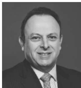
Executive Vice President since April 2012 Age 56